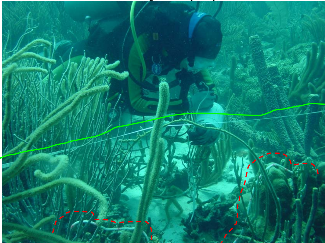
Fig. 10. Although it is difficult to see, the transect line is in the center of the photograph, and the weighted line is along the coral below the transect line.