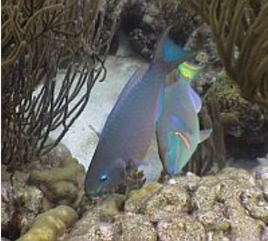
Fig. 7. Spotlight parrotfish chopping on turf algae. This area is not within a damselfish territory. If the parrotfish were grazing within a damselfish territory, they would immediately be chased away.