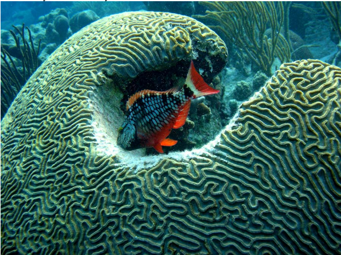
Fig. 8. Parrotfish eat turf algae off coral reefs. Grazing parrotfish and surgeonfish are crucial herbivorous contributors to overall reef health. Baby corals cannot settle in a place where algae is growing.