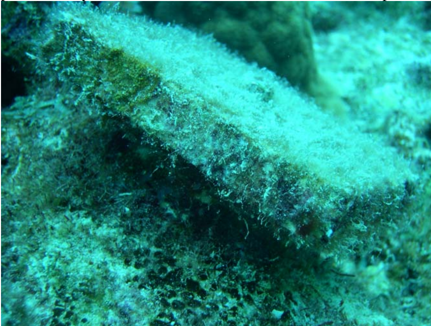
Fig. 2. A 10 inch coral plate that has been fouled with turf algae. Baby corals settle on the underneath side of the plate. Many plates were fouled like this, yet other tiles did not have any algae on them. It was very interesting to see the reef take over plates. I often found brittle stars, fire worms, sponges, and all sorts of other reef organisms living on the plates.