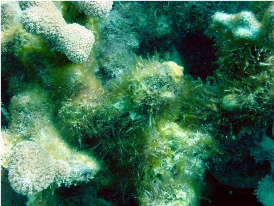
Fig. 6. Damselfish territories tend to have a concentrated amount of turf algae in the center. Turf measurements decreased from the center outward within damselfish territories. This photograph illustrates an ideal parrotfish or surgeonfish snack, if it were not so aggressively guarded by a damselfish.