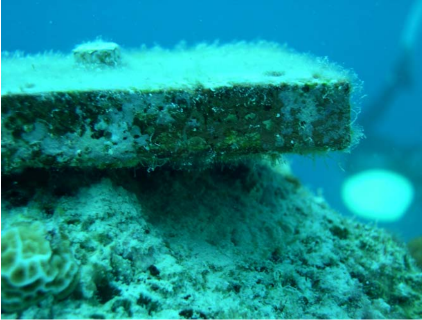
Fig. 1. A 10 inch coral plate. You can see the bolt on the top of the plate that holds the plate securely on the reef. The bolt was drilled into a dead piece of the reef.