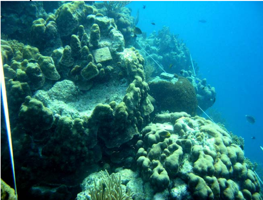
Fig. 4. Coral reef complexity in Bonaire was measured using 25m transect lines at 30-40ft (10m).