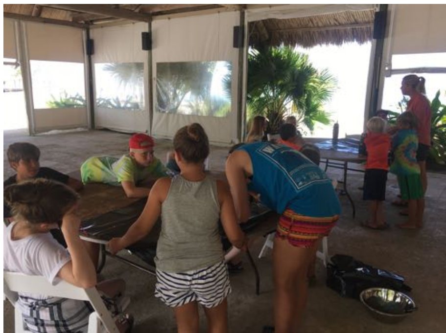
Kids dissect lionfish during a week of summer camp at Postcard Inn, a resort in Islamorada.

helping out with REEF's day camp gave me a chance to work on my kid skills. I found that, despite some crazy moments (sometimes kids and kayaks are an interesting mix), working with the kids at day camp made for a high-energy and fun week. Like my office duties, it gave me a new vantage point on marine conservation. For campers, seeing a parrotfish while snorkeling was a cause for celebration, and kayaking under a bridge on which people were walking was the best part of the day. Seeing kids' reactions to events like these was like pressing a reset button: all the things about the ocean to which I had become desensitized were fresh and exciting, and I was able to take the time to marvel at them again.