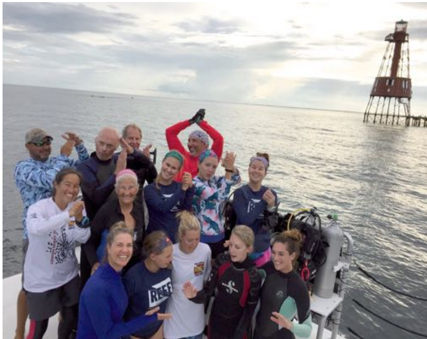
Topside photos taken before the last two dives of the summer. Top: Blue Heron Bridge dive site is near West Palm Beach and is known for having a large variety of fish and invertebrate species. Bottom: Alligator Reef is an ideal location to search for spawning hamlet pairs.

As a REEF summer intern, another component of my internship was helping with summer camp and other education programs. As I've mentioned in my blog, I've always been a bit shy around children. Why people half my size intimidate me I've never understood, but