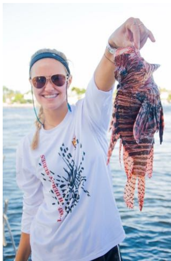
Left: the interns pose for a photo after the Fort Lauderdale Derby. Above: one of the Fort Lauderdale Derby's biggest catches.

The Key Largo Derby was a blast because it was at Pennekamp State Park, our home turf; we knew most of the people on the teams or passing through, and catching up with them made for a