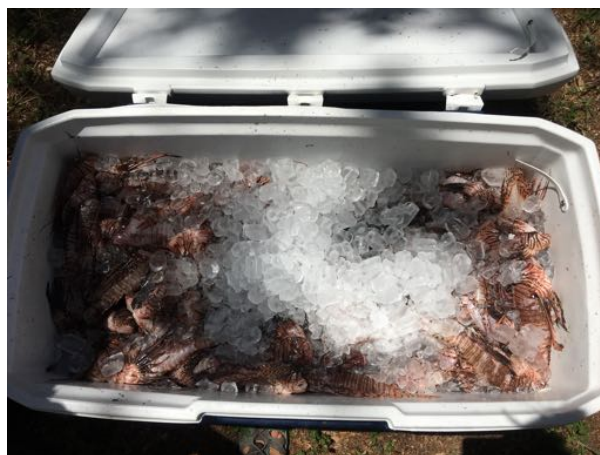
Lots of interested guests and participants (above) and lionfish (right) showed up at the Sarasota Derby at Mote Marine lab and Aquarium.