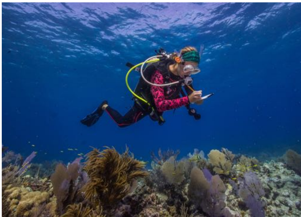
Doing a REEF survey on Molasses Reef.

But I didn't spend all of my time indoors. Once during the workweek, all of the interns spent a half-day collecting data for REEF's online marine sightings database by doing REEF fish surveys with the local dive shops. We dove and collected survey data outside of work as well; in an ideal week, we would also do at least a half-day of diving on the weekend and one night dive. I had already learned a good portion of the common Caribbean fish when I studied abroad in Bonaire, but surveying several times a week broadened my fish ID knowledge greatly.