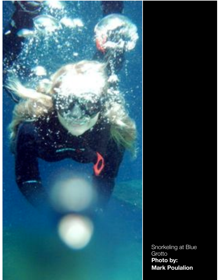
Snorkeling at Blue Grotto

Our World-Underwater Scholarship Society. I am forever indebted to OWUSS for making this experience possible. I can't say enough what an incredible opportunity it was. Again, I recognize that several people were responsible for coordinating and funding several exceptional internships. I know I would not have had this opportunity to live out a dream without Our World-Underwater Scholarship Society and its volunteers. Thank you!