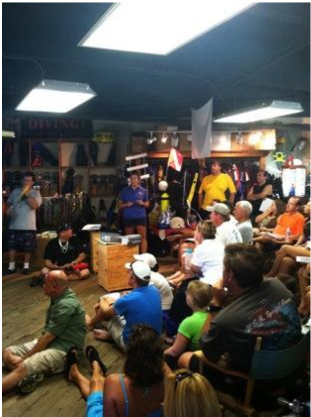
Teaching a fish ID course to the Miami-Dade Reef Guard Association

As part of the GAFC, I also represented REEF and taught a fish ID course in Miami for the Miami-Dade Reefguard Association. This group focuses on protecting the reefs around Miami and does annual monitoring of the wreck trek sites off of Miami Beach. I taught their volunteer surveyors basic fish ID's and joined them on their survey dives. This group was very excited to learn fish and put their skills to use and diving in Miami was great! GAFC events kept me busy in July but I was able to meet many great people and encourage them to survey and submit data to REEF's database.