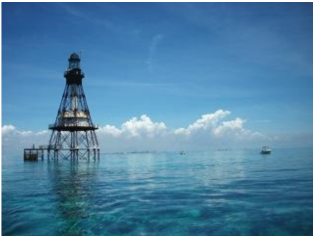
One of our snorkel spots while volunteering with Biscayne National Park

but the visibility and calmness of the water was simply amazing. The water was crystal clear and looking off in the horizon you could not even tell where the ocean stopped and the sky started. It was also an interesting day because, after spending the previous two summers doing interpretation work with the NPS, it was great to see what other divisions of the NPS do and visit a park that was created to preserve amazing marine resources.